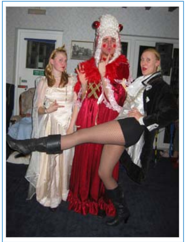
Cast of 'Dick Whittington' in pantomime costume

SG Productions will return in 2008 for a summer show 'In the Mood'. A musical tribute to the legendary Glenn Miller. Also at Christmas for the pantomime Cinderella.